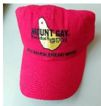
2 nd & 3 rd Place trophies; collector's items, coveted Mt. Gay hats for an event that never happened.